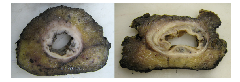
Figure 2. Cross sectional slices showing a mesorectal plane specimen with smooth circumferential resection margin (CRM) (left) and intramesorectal plane specimen with irregularity to the CRM and obvious defects, but no evidence of defects extending to the muscle tube (right)

Grading of the mesorectal plane of excision is a key marker for surgical quality and plays a vital role in providing continual feedback to the MDT team for educational and audit purposes. Feeding back the planes of mesorectal surgery in the MRC CR07 trial led to a gradual improvement in specimen quality over the duration of the trial<sup>[26]</sup>.