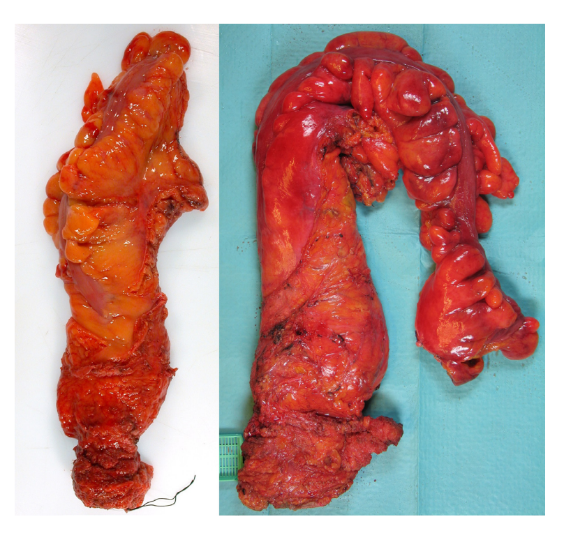
Figure 4. Two abdominoperineal specimens, the first resected in the sphincteric plane with an obvious area of waisting towards the base of the mesorectum/top of the sphincters (left) and the second resected in the extra-levator plane with no visible waisting (right)