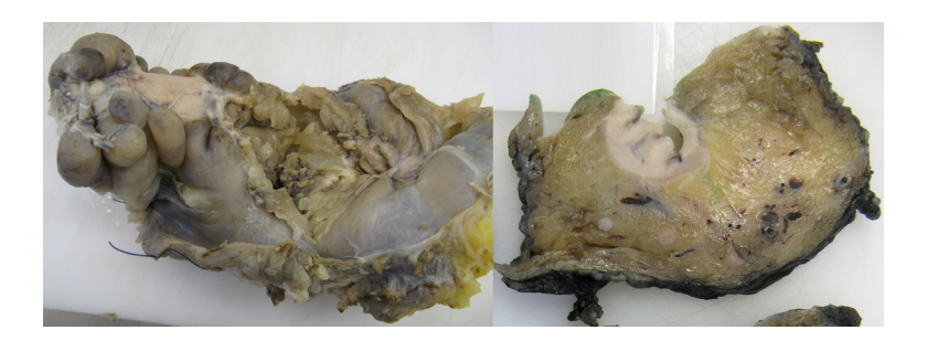
Figure 3. Anterior resection specimen showing a large anterior perforation with a defect into the lumen of the bowel (left), which is confirmed on cross sectional slicing where part of the anterior rectal wall is missing (right)