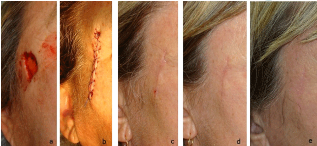
Figure 2: (a) Preoperative defect of the right temporal area following Mohs surgical excision of a Basal cell carcinoma, in a 58-year-old female with Fitzpatrick II skin type; (b) intraoperative appearance following dog ear excision and closure using the Running-X technique; (c) ten days postoperatively; (d) six weeks postoperatively; (e) twelve weeks postoperatively

marks. The authors in this report have primarily used this technique for brow and forehead wound closures. Therefore, the sutures were removed at 5 to 7 days from closure.