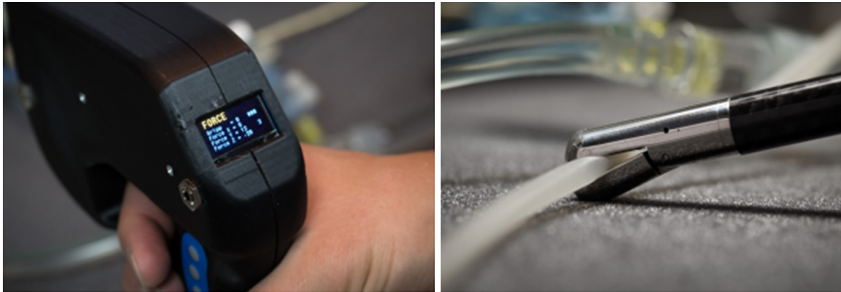
Figure 2. Selected elements of the history of the Robin Heart surgical robot, which was created in the FRK in a team led by the author

simulation and modeling of heart surgery by creating data on the hemodynamic effects of surgery performed in a given way [15-19] . Figure 2 shows examples that demonstrate the achievements of the FRK within the scope of 1-3 of the AI implementation plan for MIS.