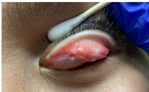
Figure 2. Eversion of the left upper eyelid revealed a bluish cystic mass

represents the majority of cases, making up about 79%-90% of pediatric cases [2-4] . Pediatric ptosis associated with amblyopia, refractive error, and strabismus warrants surgery [5,6] .