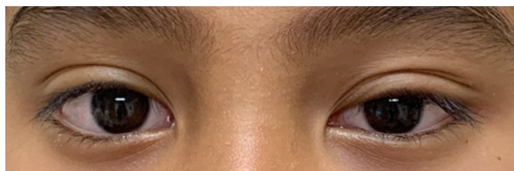
Figure 1. External front view of the patient, who presents with ptosis of the left upper eyelid