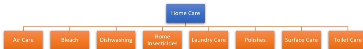
Figure 2. Summary of all product categories used in evaluating chemical ingredient weight fractions per home care product category.