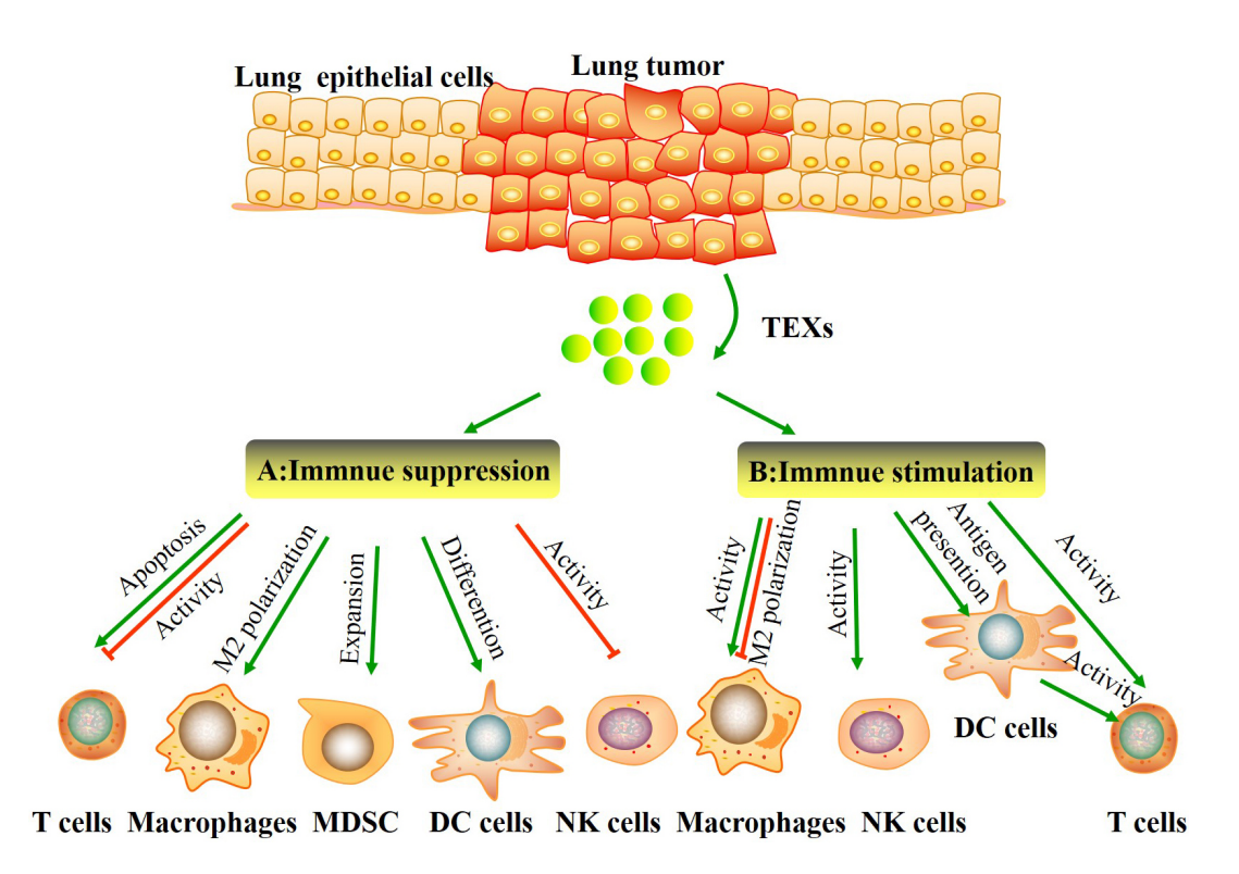
Figure 2. Tumor-derived exosomes (TEXs) carry and deliver both immunosuppressive and immunostimulatory signals to immune cells in the lung tumor microenvironment. (A) Immune suppression. TEXs contribute to establish an immunosuppressive TME by inducing apoptosis and inhibiting the activity of effector T cells, skewing M2 polarization of macrophages, expanding myeloid-derived suppressor cells (MDSCs), suppressing DCs differentiation, and impairing the function of NK cells. (B) Immune stimulation. TEXs can also stimulate immune cells to support antitumor activities, including enhancing the activity of macrophages and NK cells, suppressing M2 macrophage polarization, and increase T cells activity directly or indirectly.

NSCLC: Non small cell lung cancer; DCs: dendritic cells; MDSCs: myeloid-derived suppressor cells.