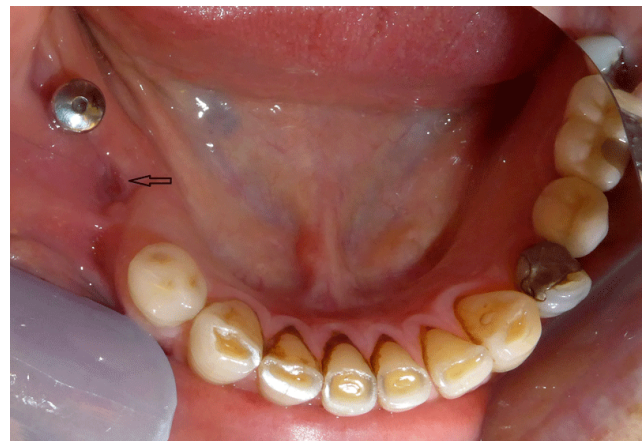
Figure 3: Remission of pain, swelling and purulence (August 2015)