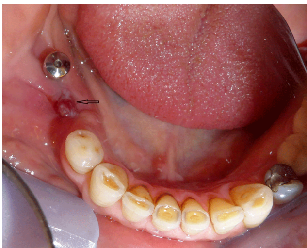
Figure 1: Swelling, fistula and purulence on the post extraction non-healing socket (July 2015). Necrotic bone could be probed through the fistula

A 64-year-old male, smoker was diagnosed on April 2010 with myelodysplastic syndrome (refractory anemia) of low-risk according to IPSS (normal karyotype, without cytopenia, blasts 3-4%). [19] One year later the patient progressed to refractory anemia with excess blasts, type II (RAEB-II), normal karyotype, without cytopenia, blasts 15%. [20] He was placed on 5-azacitidine therapy [75 mg/m 2 (150 mg) day 1 to day 7 on 28 days cycle] with partial remission (Hgb > 11 g/dL, Platelets > 100 × 10 9 /L, Neutrophils > 1.0 × 10 9 /L, bone marrow blasts decreased by 50% but still > 5%). Two years later, after 17 cycles of 5-azacitidine, he progressed to AML. His complete blood counts showed: Hemoglobin 9.6 gr/dL, white blood cells 21.6 × 10 9 /L, absolute neutrophil count of 4.0 × 10 9 /L, immature white blood cells (myelocytes, metamyelocytes) and blasts 5.0 × 10 9 /L, platelets 142.0 × 10 9 /L. Bone marrow biopsy revealed 25-30% infiltration of CD34 (+) cells (blasts). Cytogenetic analysis (karyotype) was normal (46XY). He received 7 + 3 induction chemotherapy [intravenous infusion of Cytarabine (200 mg/m 2 day 1 through day 7) and Idarubicin 10 mg/m 2 on 30' infusion on day 2, 4, 6]. During hospitalization the patient developed neutropenic fever, managed with empiric antibiotic treatment (piperacilin + tazobactam and amikacin) and red