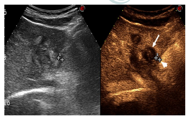
Figure 3: Oblique subcostal contrast-enhanced ultrasound scan of the left lobe of the liver performed a few days after laser thermal ablation, showing complete ablation of the metastasis with a 24 mm × 22 mm avascular area in segment II (arrows), at a distance of 4 mm from the diaphragm and pericardium (arrowheads)

A 41-year-old man underwent LTA of a small, 11 mm colorectal metastasis in segment II of the liver, in close proximity to the diaphragm and pericardium [Figure 1]. Four liver metastases in the right lobe and one metastasis in segment III had been successfully ablated by LTA three